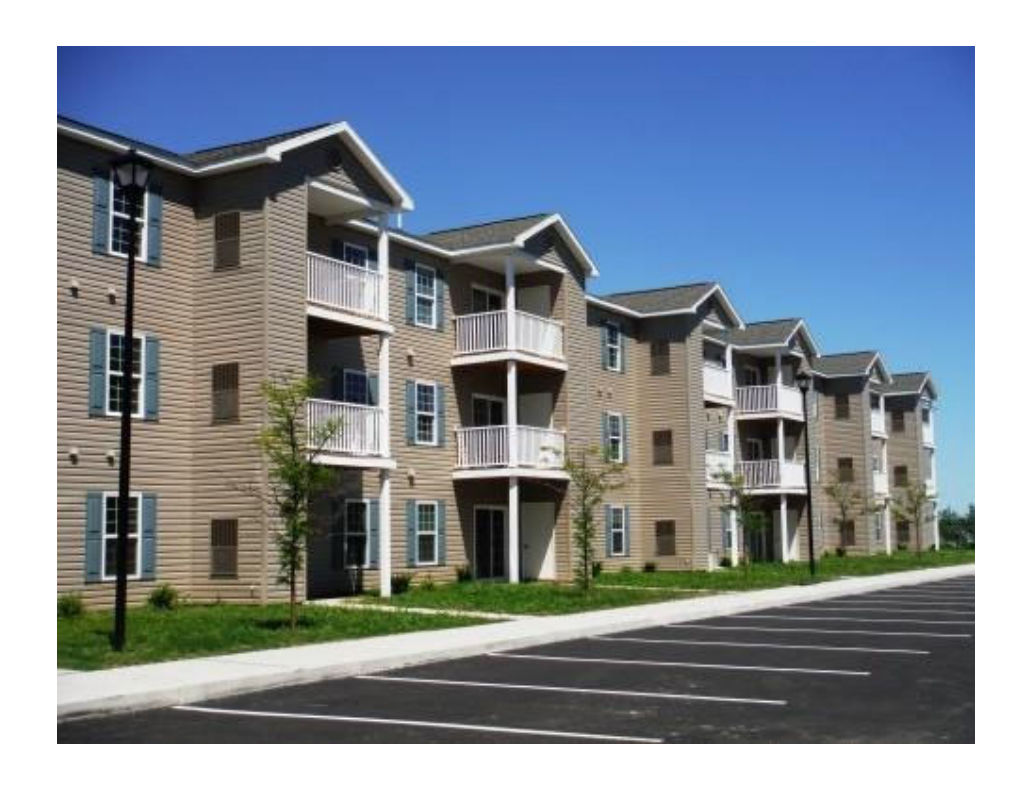
Figure B. Parking area without accessible parking or curb cuts, online photo from apartments.com of Camillus Pointe Senior Apartments, Camillus, New York.