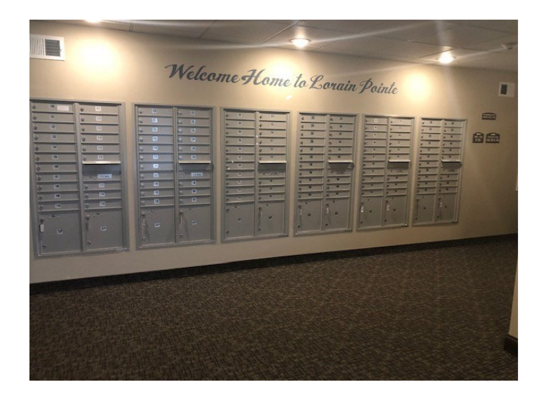
Figure F. Mailboxes at Lorain Pointe in Lorain, Ohio.