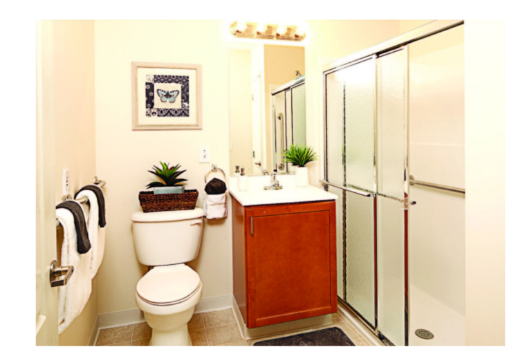
Figure I. Online photograph of a bathroom in Buckley Square Senior Apartments, in Syracuse, New York, with the same layout as Lorain Pointe, accessed March 17, 2022, at https://www.apartments.com/buckley-square-senior-apartments-north-syracuse-ny/n48mqhm/.