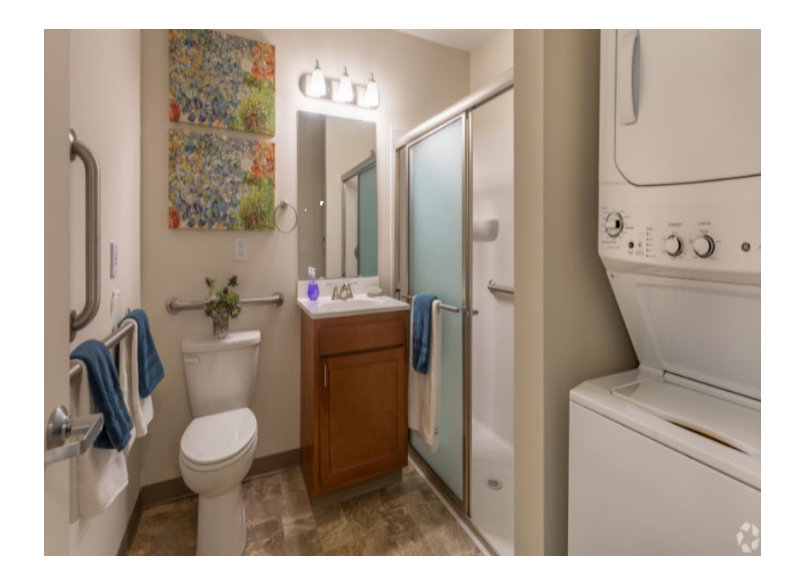
Figure H. Online photograph of bathroom in Lorain Pointe which lacks clear floor space parallel to the shower and flush with the control wall because of the sink and the wall between the shower and washer/dryer, accessed January 17, 2022 at https://www.apartments.com/lorain-pointe-senior-apartments-lorain-oh/zm5c4bw/.