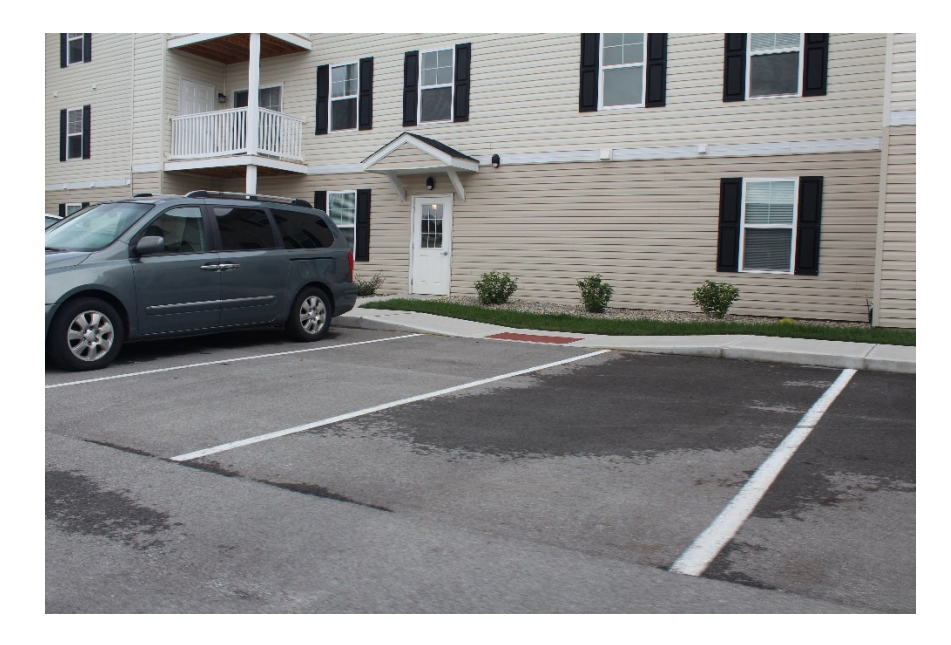
Figure E. The slopes on either side of the curb cut exceed 5% and interrupt the accessible route at Pleasant Run Senior Apartments, Indianapolis, Indiana.

patio because the threshold is too high. As a result, residents with mobility disabilities seeking to use the patio must use longer, circuitous routes with steps or steep ramps.