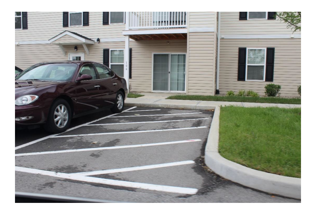
Figure D. Striped access area without curb cut at Pleasant Run Senior Apartments, Indianapolis, Indiana.