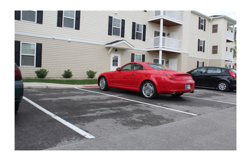
Figure C. Car blocking curb cut with no access aisle at Pleasant Run Senior Apartments, Indianapolis, Indiana.