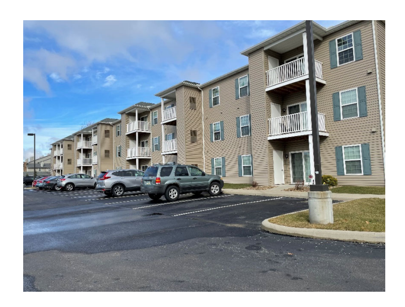
Figure A. Parking area without accessible parking or curb cuts at Parma Village Senior Apartments, Parma, Ohio.